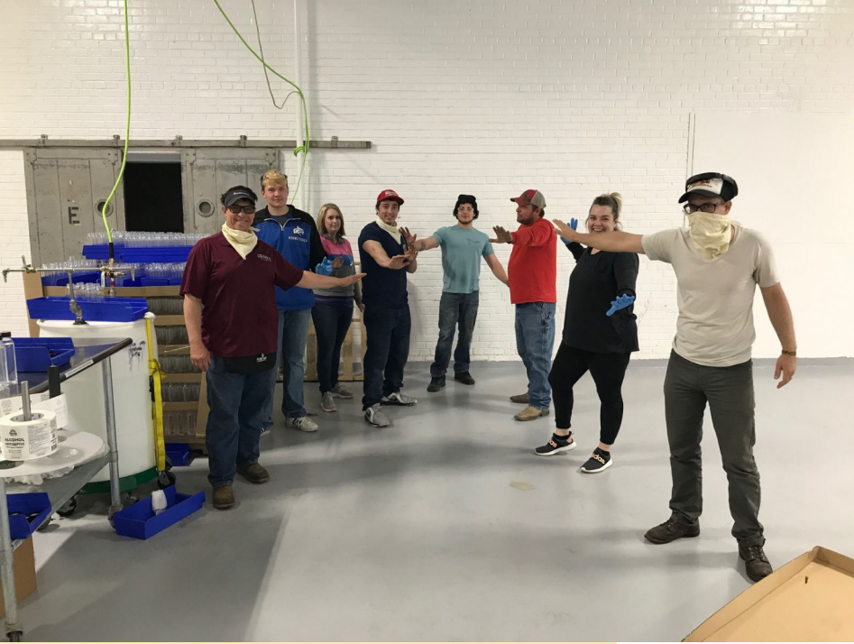
The Pacha Soap team practices their "social distancing" while preparing a batch of hand sanitizer to distribute through the Hastings Community Foundation.