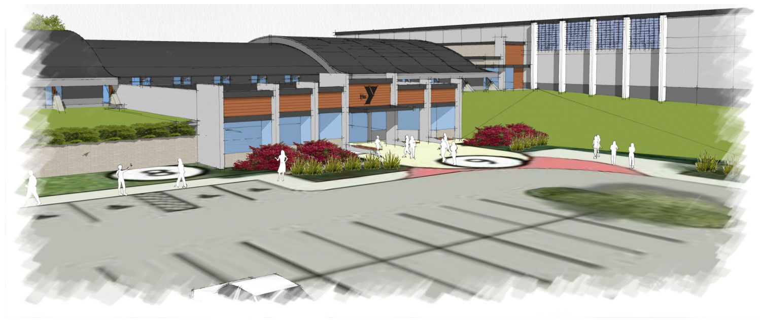
Rendering of the remodeled exterior of the Hastings Family YMCA's 16th Street location.