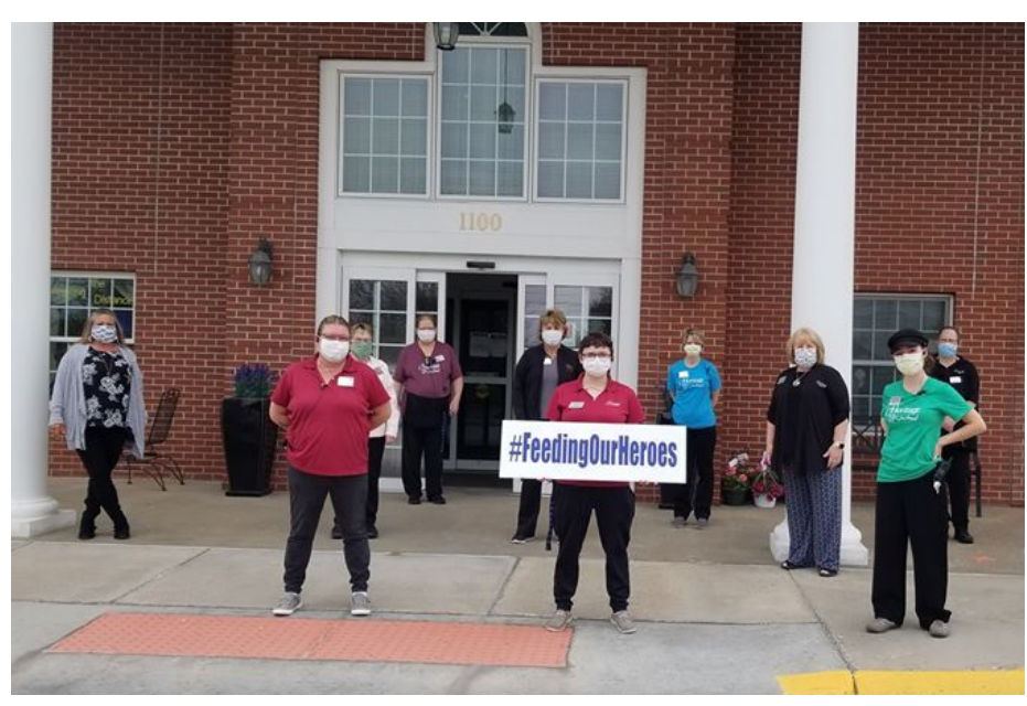
Feeding Our Heroes brought lunch to staff of The Heritage at College View Assisted Living in May.

For more information on how you can make a gift to the COVID Community Response Fund or the Feeding our Heroes program, contact the Hastings Community Foundation or the United Way of South Central Nebraska.